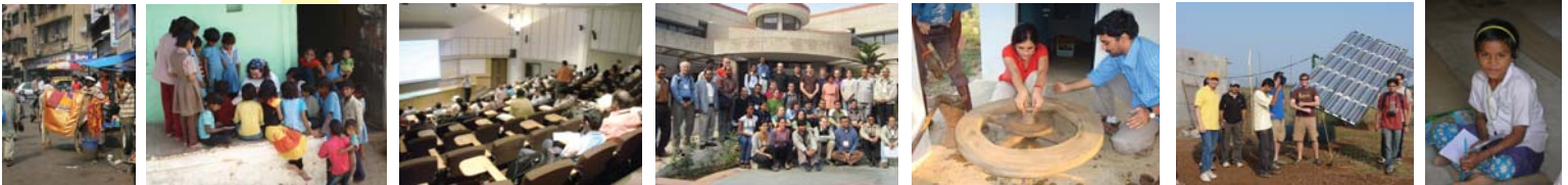
Scenes from prior iWSGs held in India (2007-2010)

Universidade Estadual de Campinas (UNICAMP), Brazil