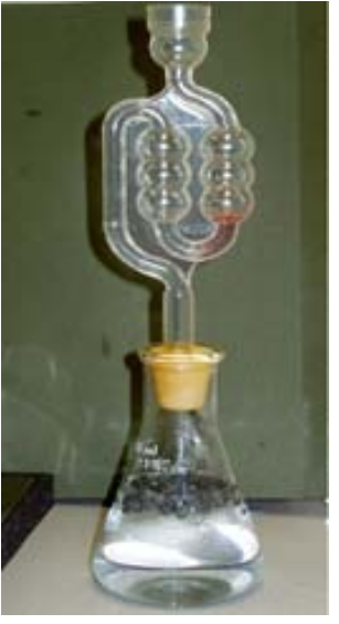
Flask with bubbler