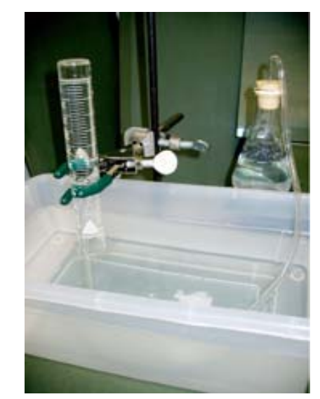
Collecting gas by water displacement

Guided Dialogue Before beginning the lab, review the meaning of these terms: Catalyst A substance that is used to increase the reaction rate of a chemical reaction but does not become part of the end products. The catalyst provides a different pathway or mechanism that makes bond making, bond breaking or electron exchange occur more rapidly. It lowers the activation energy needed for the reaction to proceed (see "reaction energy diagram" in Wikipedia). Oxidation Loss of electrons (in this reaction, oxygen in hydrogen peroxide is both oxidized H_2O_2 \rightarrow H_2O and reduced H_2O_2 \rightarrow O_2 ). Reduction Gain of electrons and reduced H_2O_2 \rightarrow O_2 in the overall reaction H_2O_2 \rightarrow H_2O + O_2 .